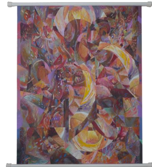
Particle Space 2017