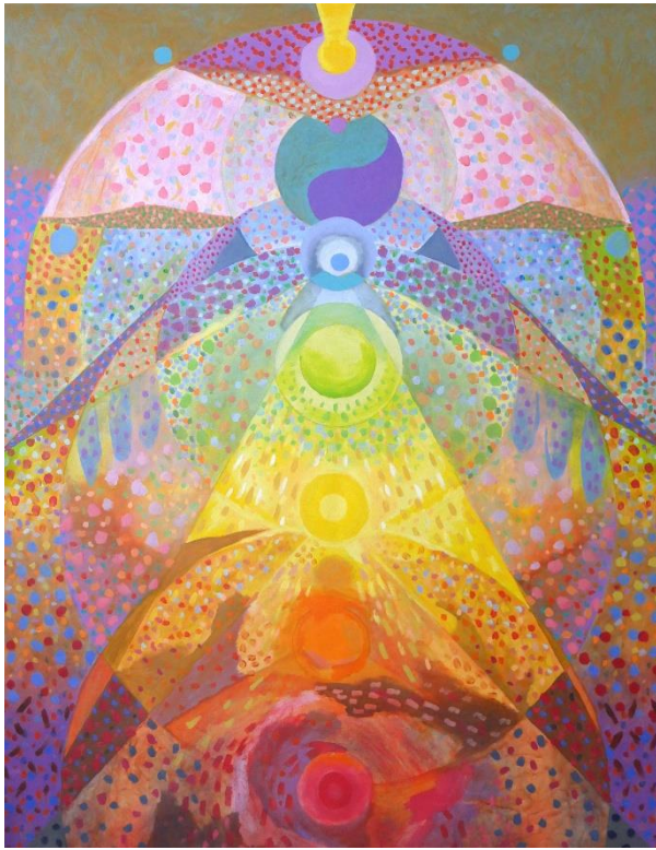
2015 Chakra 10